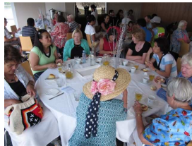
Some more tables at Harmony Day