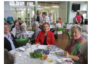
Some of the guests at the IWD luncheon