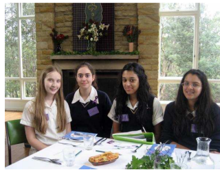
Representatives from Hornsby Girls' High School