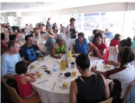
Some of the tables at Harmony Day